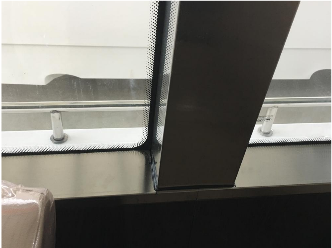
Stainless steel window trim