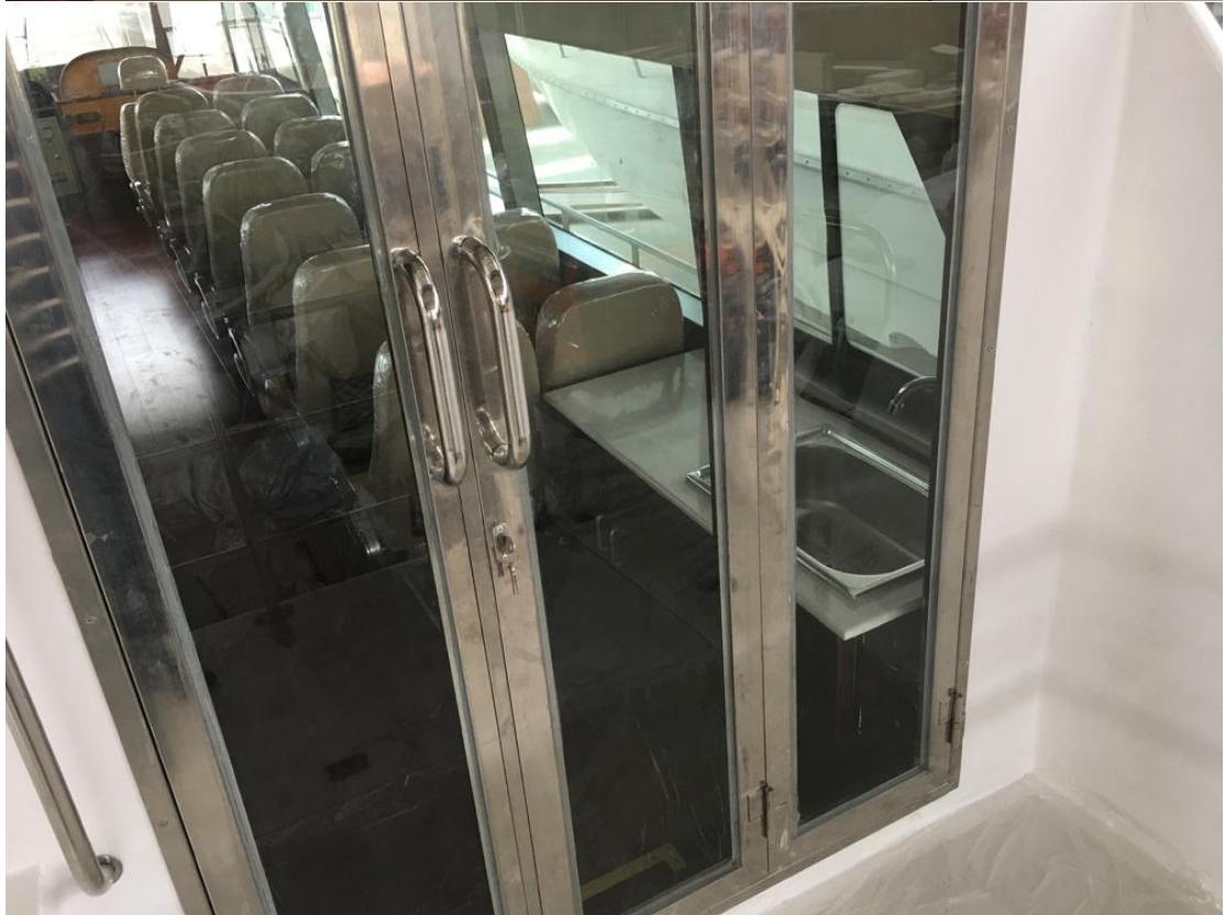
Stainless steel door