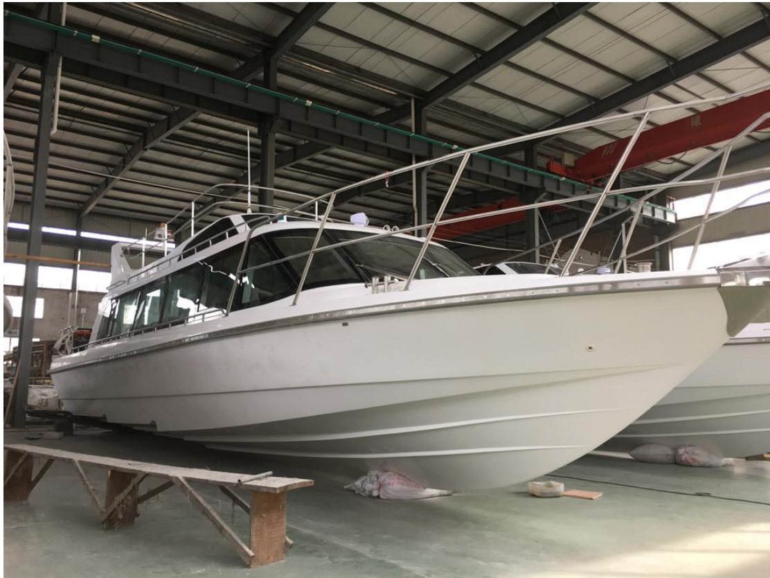
High speed V hull with step waterline for high speed rough seas