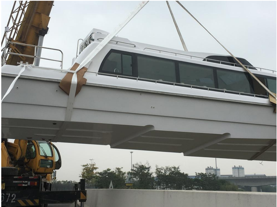
High speed step waterline