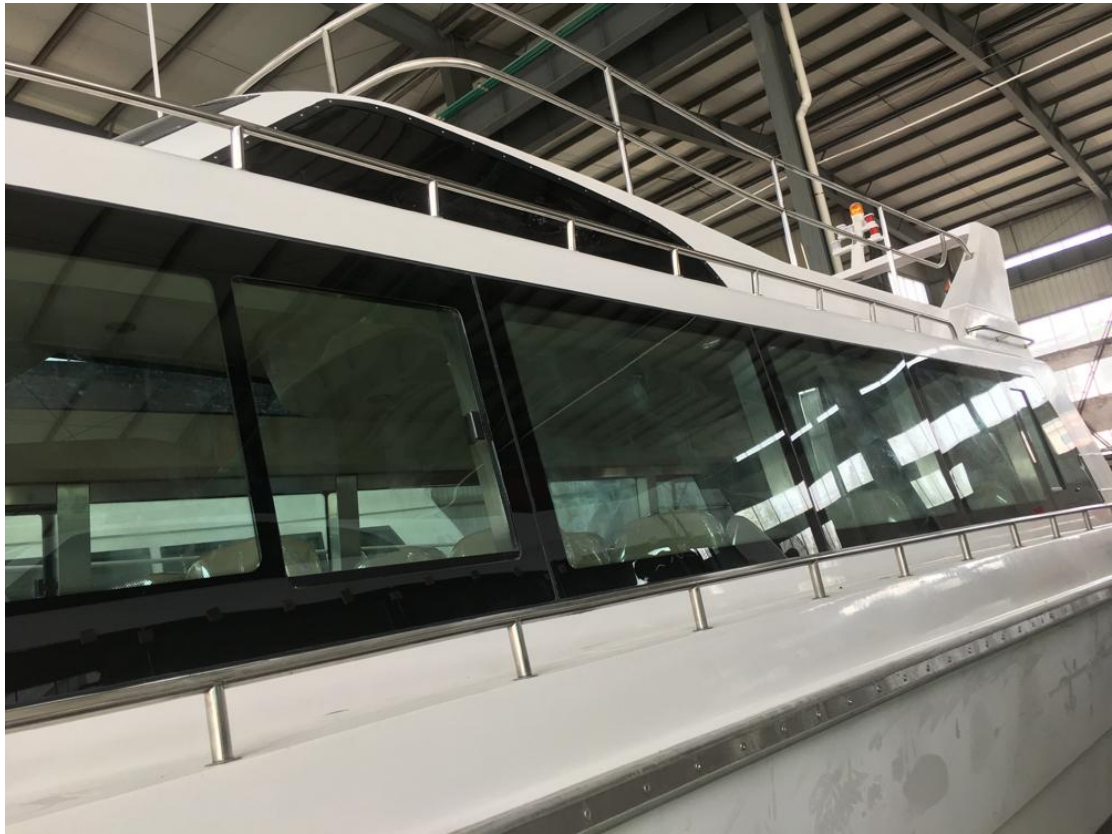
Both sides have double open windows