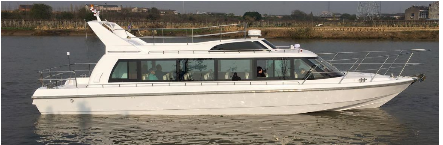
Trail High speed over 30kn with 2x200HP Yamaha outboard engines