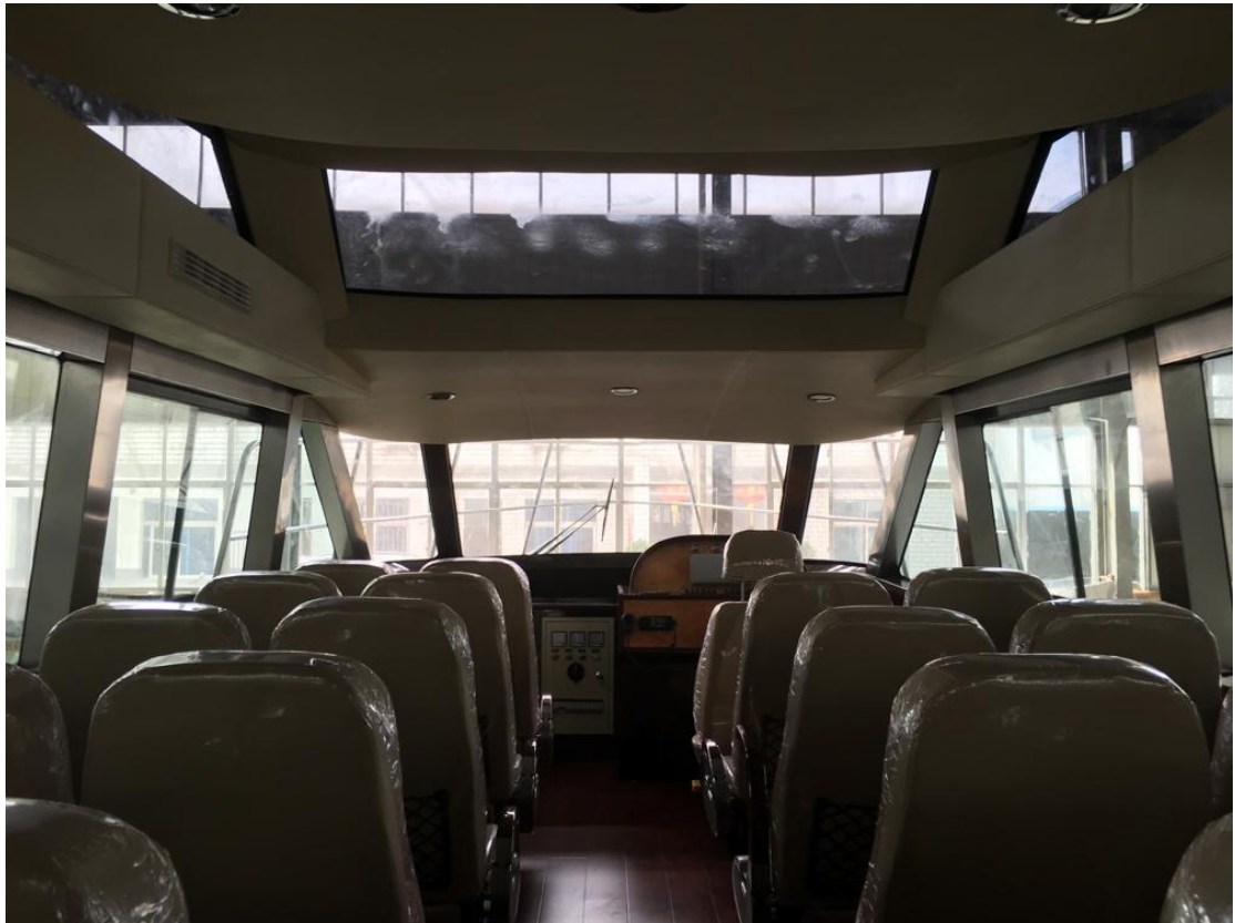
Raised front top vista window