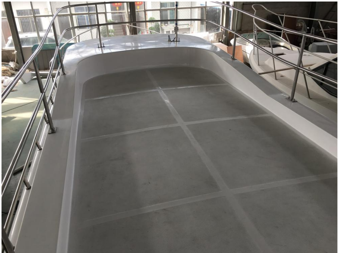
Flybridge with high s/s fence rails for extra seating